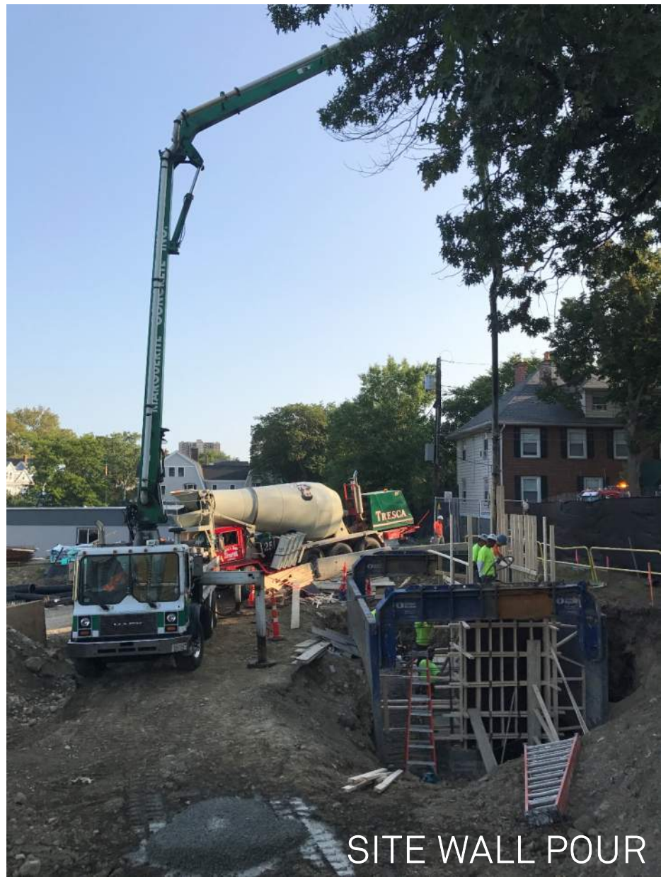
SITE WALL POUR