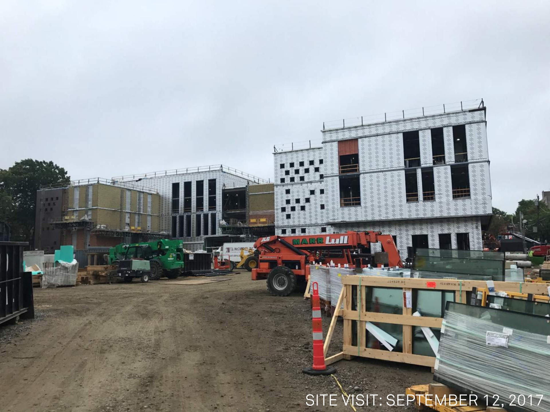
SITE VISIT: SEPTEMBER 12, 2017