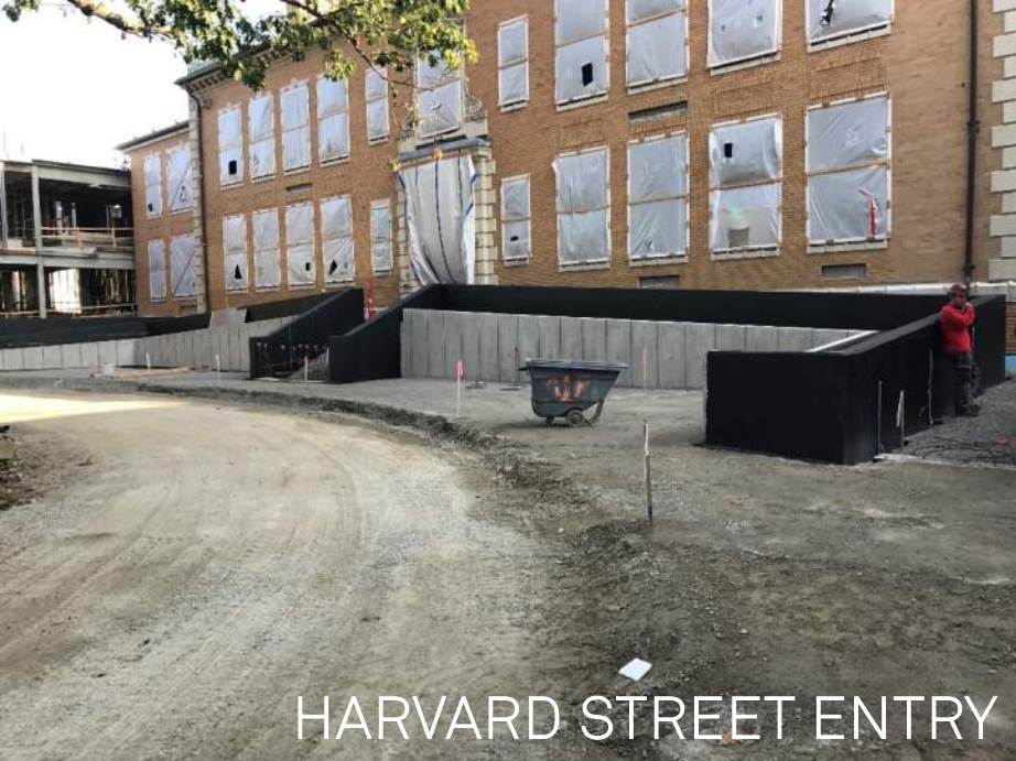
HARVARD STREET ENTRY